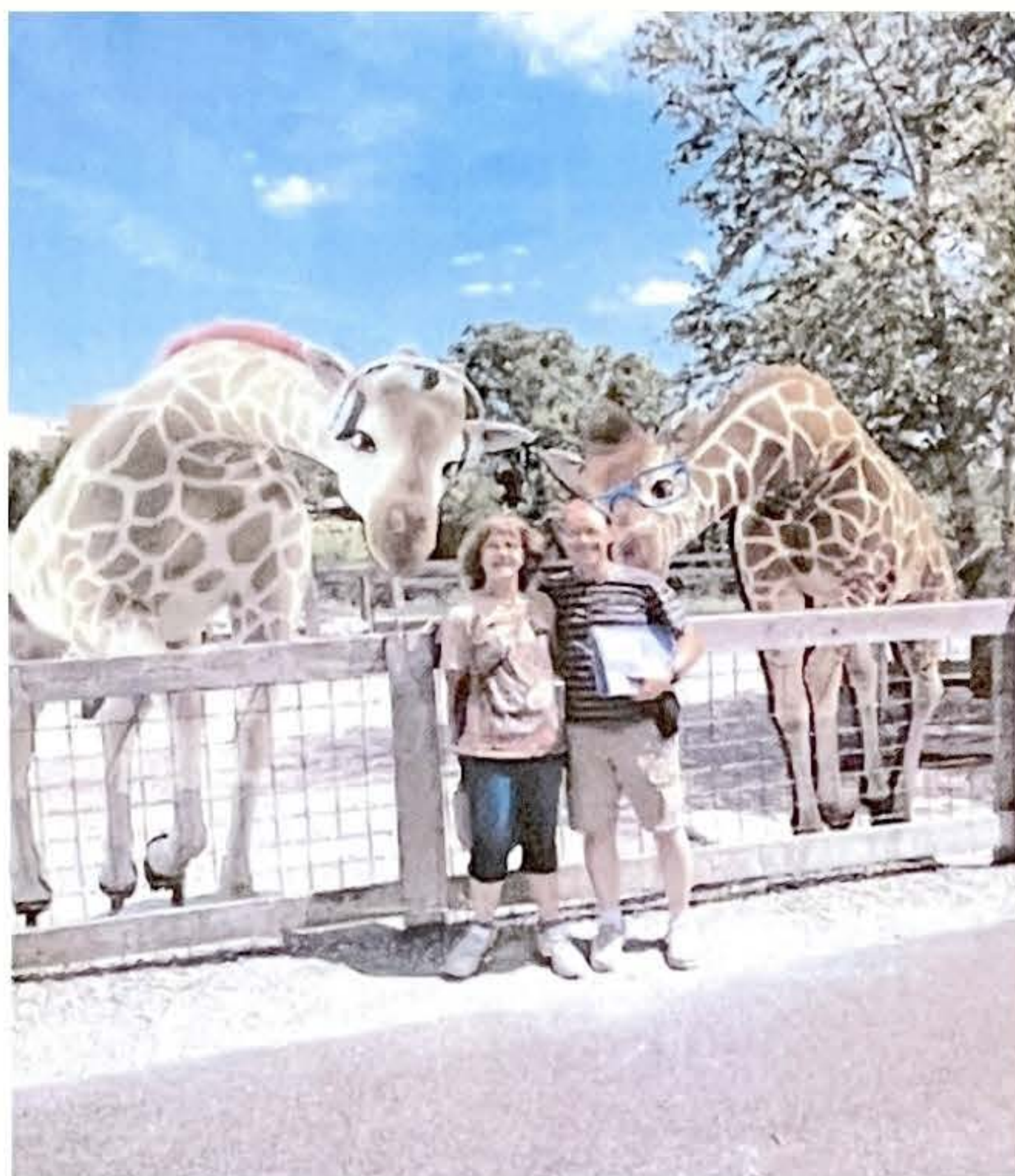
At the Ark zoo